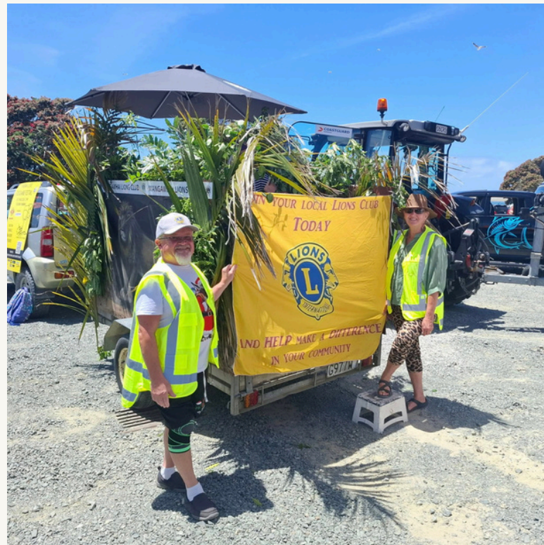
2025 Mangawhai Santa Parade